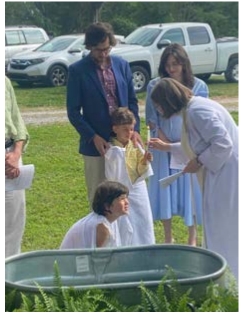
Joseph receives the light of Christ